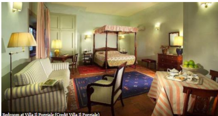
Bedroom at Villa Il Poggiale (Credit Villa Il Poggiale) Bedroom at Villa Il Poggiale (Credit Villa Il Poggiale)

The price of the four-night "Ultimate Bachelor Party" package starts at $2850 per person (for a minimum of four guests) including the cost of accommodations, golf, the test drive, wine tasting, country barbecue, private hotel transfers and select meals. The package does not include airfare and can be customized with other experiences for bachelors (or bachelorettes.)