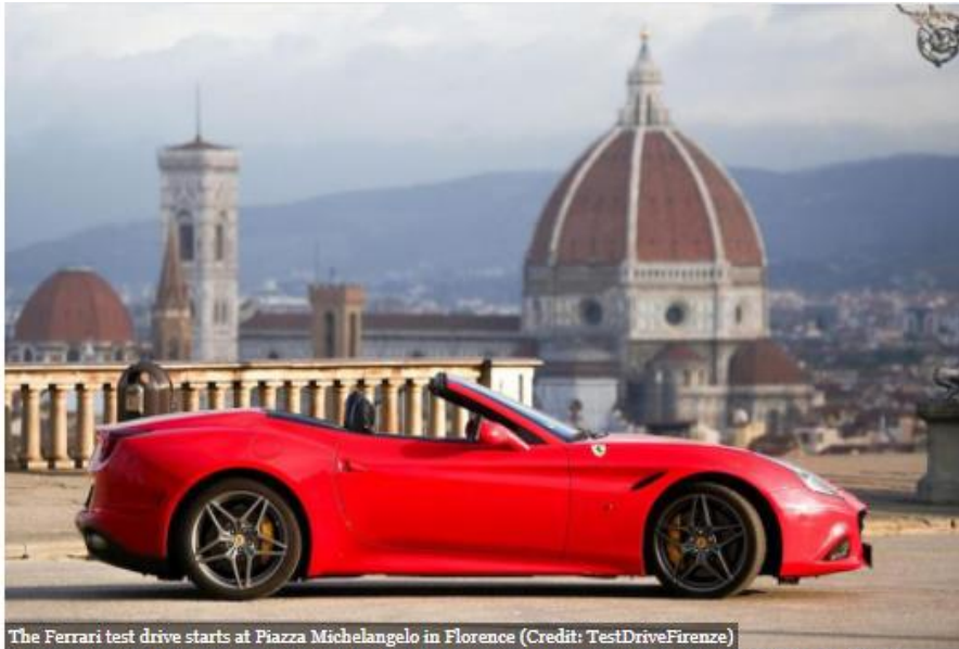
The Ferrari test drive starts at Piazza Michelangelo in Florence (Credit: TestDriveFirenze) The Ferrari test drive starts at Piazza Michelangelo in Florence (Credit: TestDriveFirenze)

Opinions expressed by Forbes Contributors are their own.