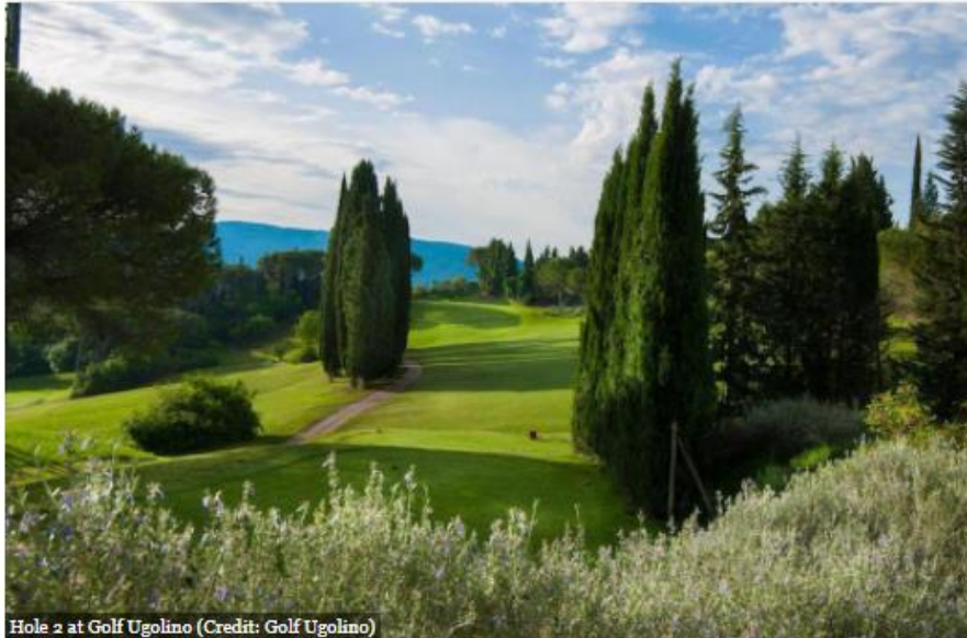
Hole 2 at Golf Ugolino (Credit: Golf Ugolino) Hole 2 at Golf Ugolino (Credit: Golf Ugolino)

Perillo's "Ultimate Bachelor Party" starts in Florence. From there, the group is taken to Villa Il Poggiale , a luxury Renaissance villa located in the heart of Tuscany. In the days that follow, the group hits the links at 18-hole Golf Ugolino , test drives a new Ferrari California T through the Florentine hills and enjoys a wine tasting at a local vineyard. On the last day, the group arrives at Tenuta Torciano Winery in Chianti for a hands-on barbecue lesson followed by a hearty feast of grilled meats, roast vegetables, local cheeses and more.