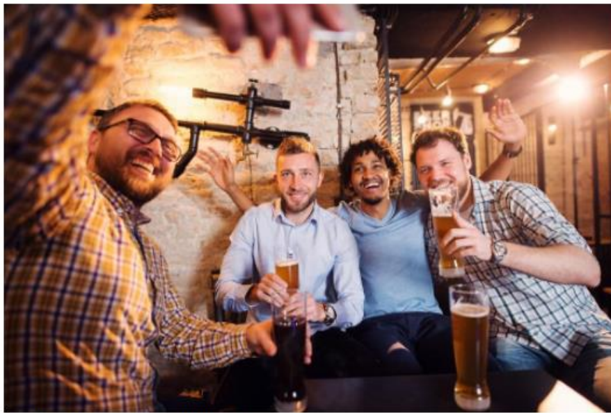
Bonding over beer

Over time, this rite of passage seems to have morphed into something far tamer—but also more costly. Millennial bachelor parties often involve male friends and family of the groom celebrating and bonding with one another at appealing vacation venues, usually held over long weekends.