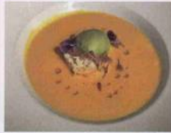
At Ocean, the 41st POTUS ordered lobster thermidor, above, while the former FLOTUS opted for the seasonal yellow heirloom tomato gazpacho.