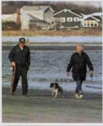
The Bush family, including former President H.W. Bush and the late Barbara Bush, has long resided in Kennebunkport.

trade-off: When the crowds decamp, you can live like a president — if only for a weekend — for less, thanks to off-season rates at Kennebunkport's most luxurious digs.