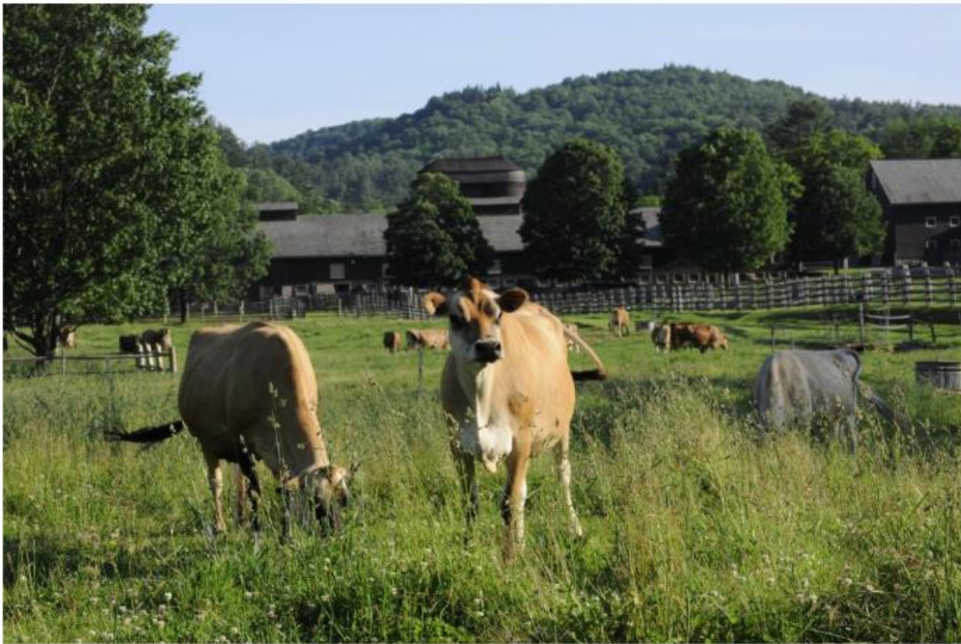
Cows in pasture at Billings Farm & Museum, Vermont BILLINGS FARM & MUSEUM

Billings Farm & Museum , Woodstock, Vermont is perfect educational and fun day trip to take the kids and is welcoming back visitors with a brand new Heifer Barn, a blooming 10,000 square foot Sunflower House, and a summer camp for junior farmers. The farm follows Vermont's Department of Health and CDC guidelines prioritizing the well-being of the guests, staff, and animals. Spaces open to guests include the pastures, walking trails, Visitor Center & Theater, "Upon This Land" exhibit, Farm Life Exhibits, Wagon and Chicken Barns. The new Heifer Barn with state-of-the-art technologies ensuring "cow comfort" is open for tours. Visitors can explore The Sunflower House, the Heirloom Garden, Victory Garden, Pollinator Garden, and Pizza Garden.